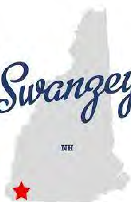
Designed by TownMapsUSA.com